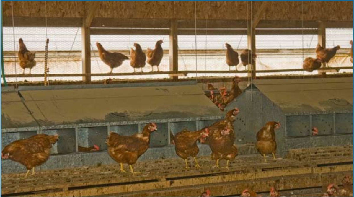
Two-layer barn with raised droppings pit, nest boxes, feed and water and roosting area, with additional perches in the background.