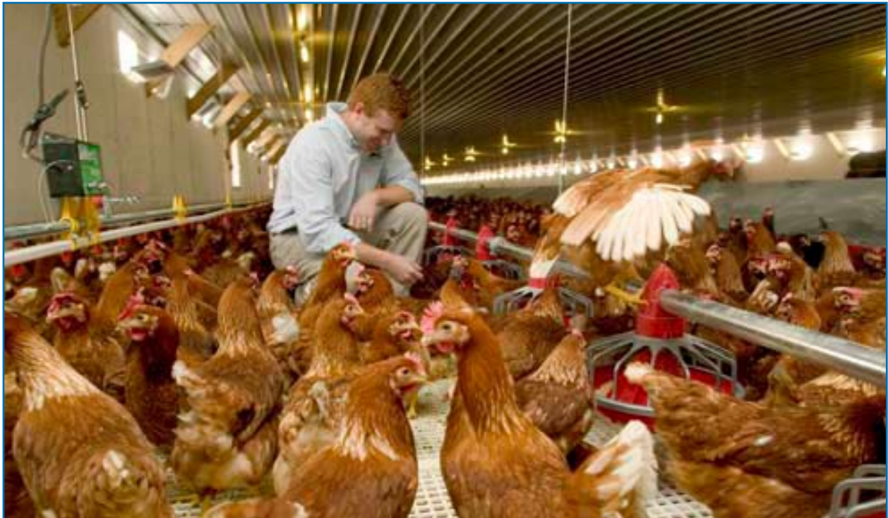
One-level barn. In these systems, sawdust, shavings or other dustbathing substrate is provided throughout the house in large boxed areas.

The following photos illustrate various barn housing systems allowed by HFAC.